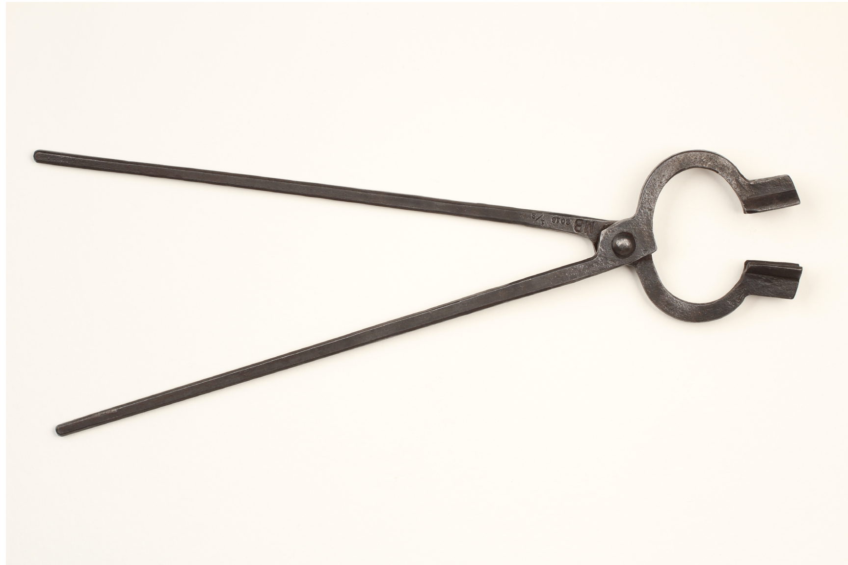
Hand-forged steel tongs, ca. 2016