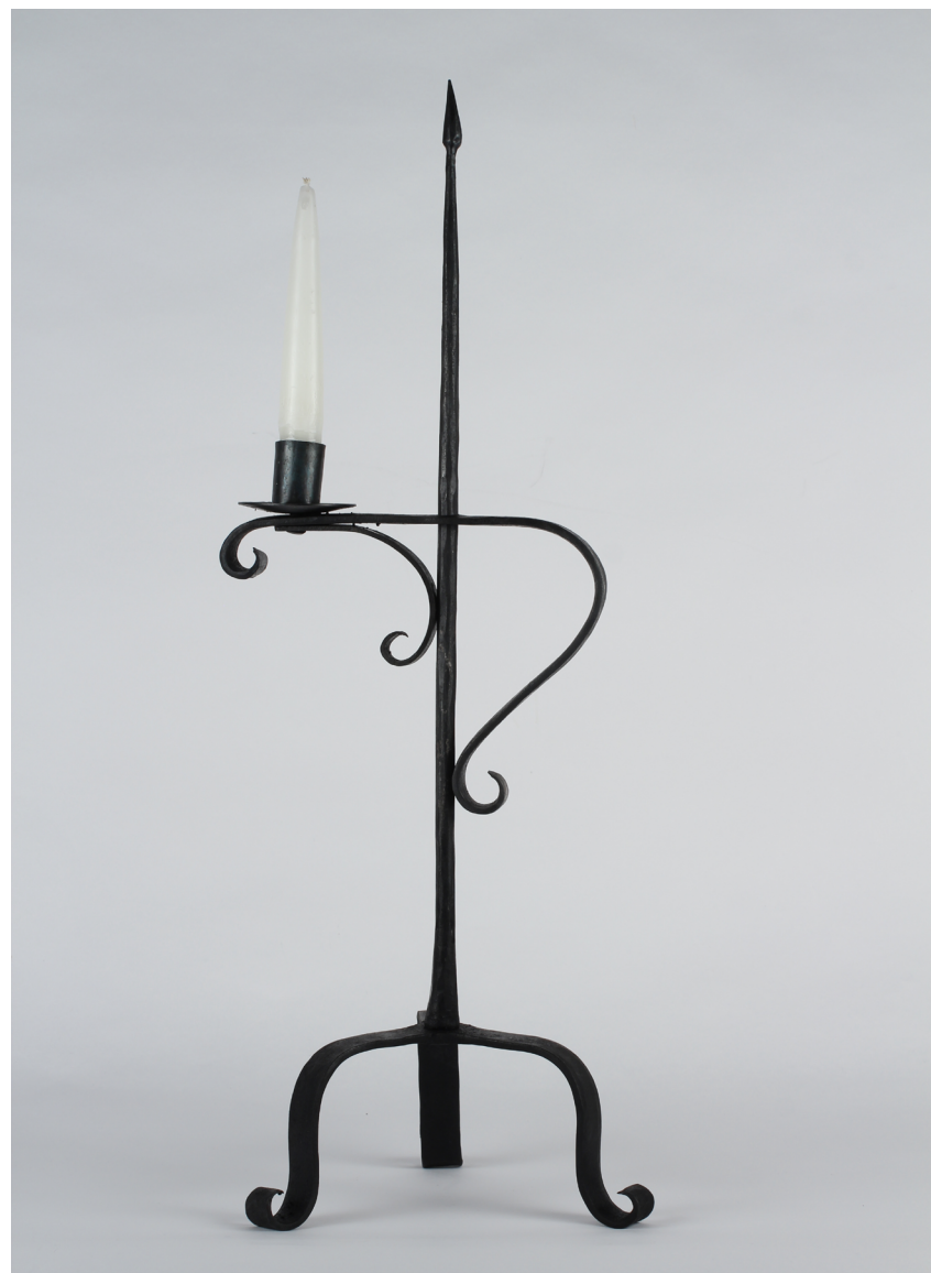
18th Century Lamp Reproduction, ca. 2019