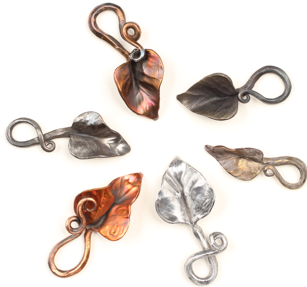
Six Metal Leaves, ca. 2019