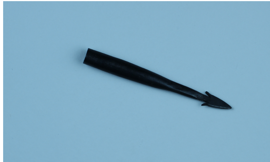
Three-prong gig and a spike, ca. 2019