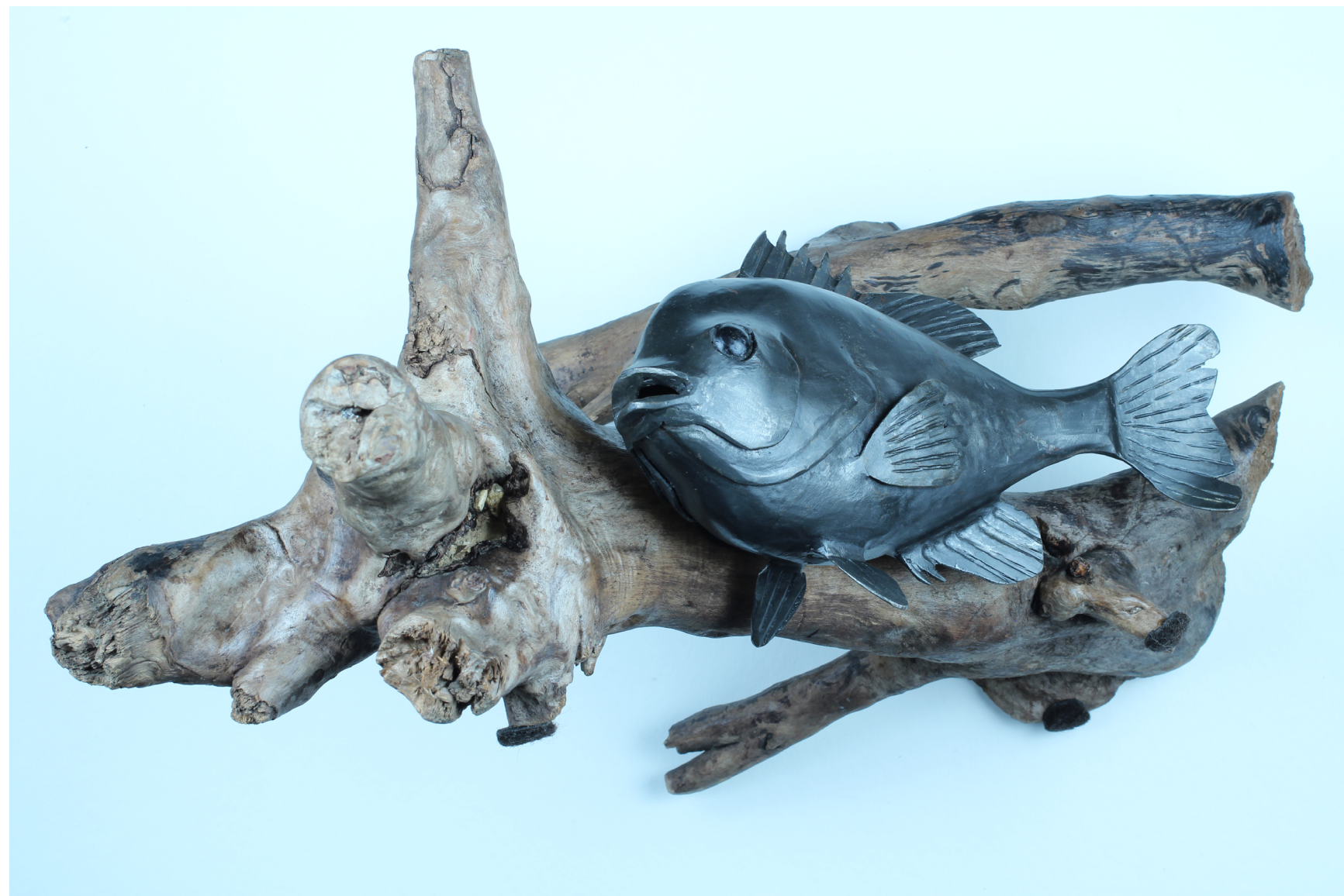
Bluegill, ca. 2010

Bluegill, ca. 2010 Hand-forged steel mounted on driftwood Courtesy of Scrub Oak Forge Robert Alexander (b. 1951, St. Louis, Mo.), Blacksmith