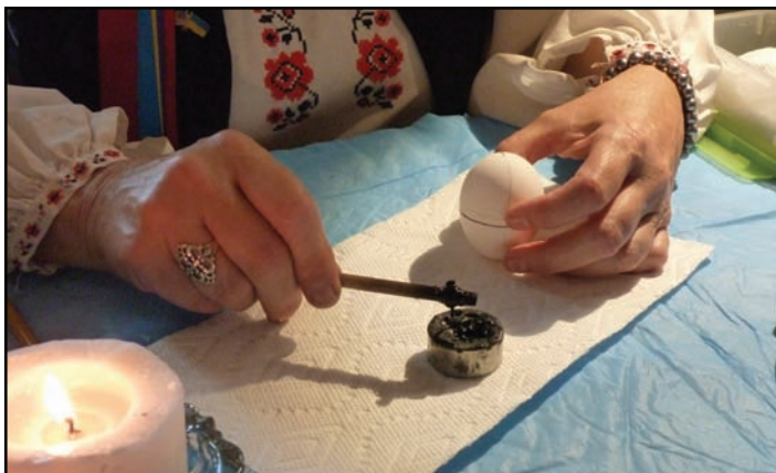
Thompson applies design to egg using black wax and stylus.

When we arrived, my companion Gene Weinbeck and I walked the festival grounds, where we were met by the smell of roasting kielbasa and the sounds of rehearsing tamburitza musicians. In a covered exhibition area, we visited crafts people and studied a historical display of the Sugar Creek Slavic Festival that included photos, newspaper articles, fliers, and recipes. Then, we observed (and sampled from) traditional meals of sarma (cabbage rolls), kielbasa and sauerkraut, cabbage slaw, and Croatian potato salad, as well as haluski , roznijici , kolache , povitica , and strudel.