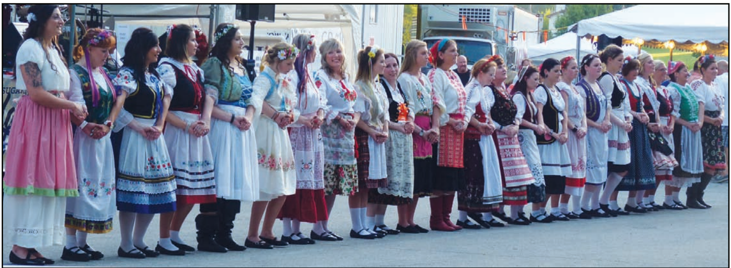
Women members of the Sugar Creek's Ethnic Dance Troupe set to perform kolo dances.