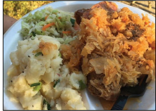
Traditional Slavic meal consisting of kielbasa and sauerkraut, Croatian potato salad, and slaw.

Save the Date! The 2017 Sugar Creek Slavic Festival Friday and Saturday June 9-10, 2017 Learn more at www.slavicfest.com