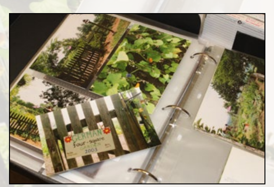
Color prints, now digitized and copied, document a German foursquare gardening tradition near Hermann