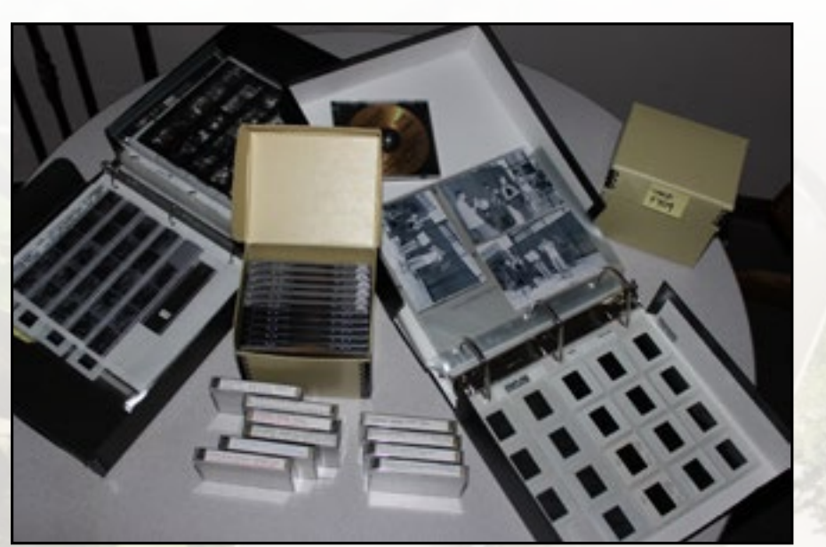
Organized, digitized and copied documentation materials prepared for transfer to MFAP's collection at the State Historical Society